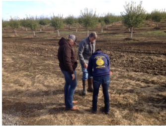
Pierce High School FFA students participated in their first SLEWS project in 10 years.

Restoration work for the day was focused on installing a drip irrigation system with plastic line that was recycled from another project. Once the line was laid, students used goof plugs to plug old emitter holes and worked together to install flags and new emitters at each location that a native plant will get planted during our next SLEWS day in January.